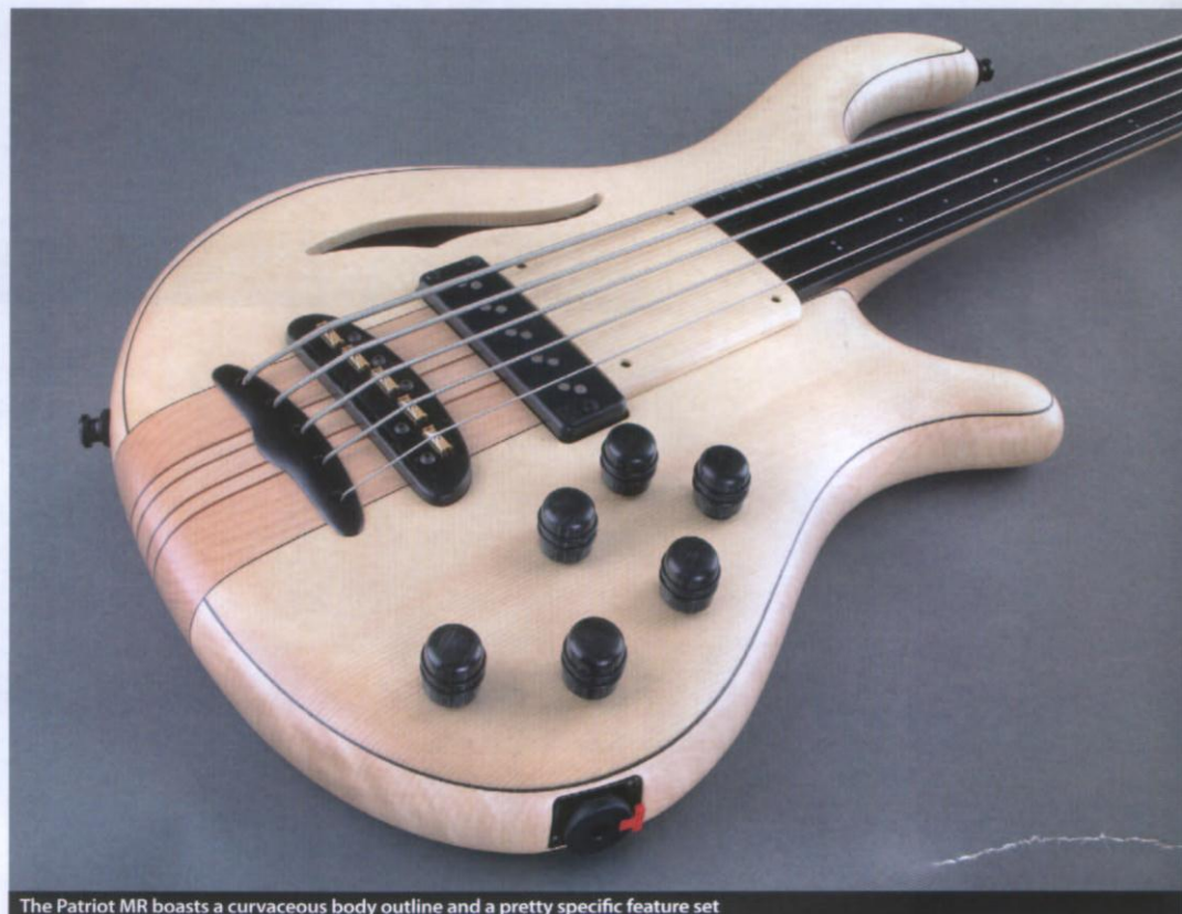
The Patriot MR boasts a curvaceous body outline and a pretty specific feature set

bypass, bass, mid and treble EQ controls, and a blend control to balance the output of the piezo system and the magnetic pickup. It's a pretty specific set-up that gives the Patriot MR real identity.